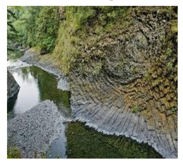
Preservation: The great basalt rosette