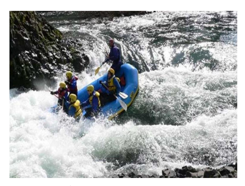
Recreation: Rafting Baby Bear Rapids at Party Rock