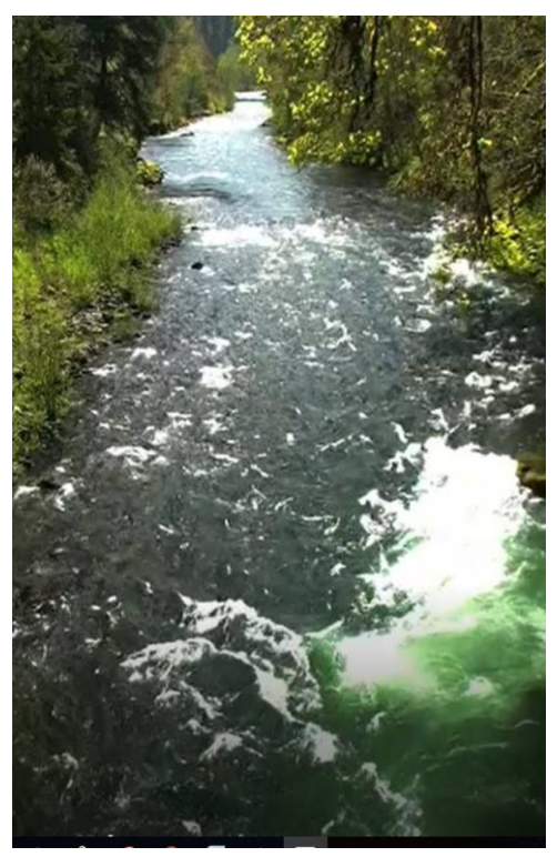
Recovery: Shaded spawning water